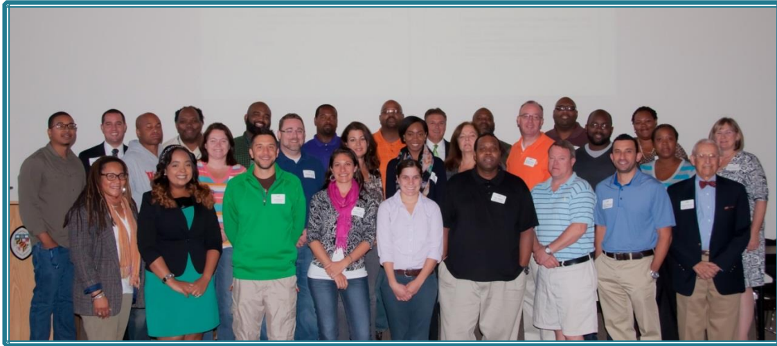
2013-2014 Stocks in the Future Educators