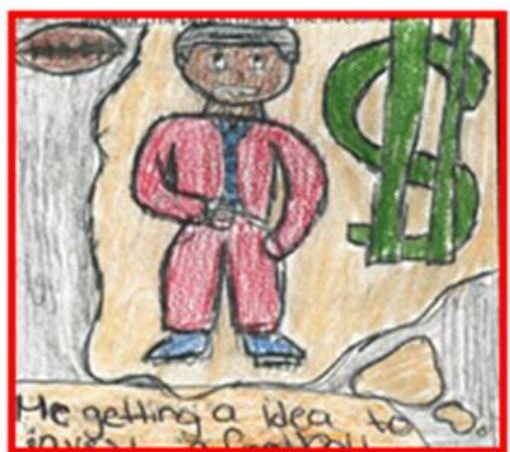
The Investor: Me getting an idea to invest in football