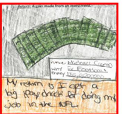
The return: I get a big paycheck for doing my job in the NFL