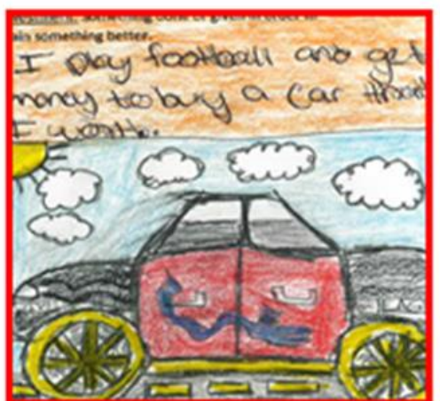
The Investment: I play football and get money to buy the car I want