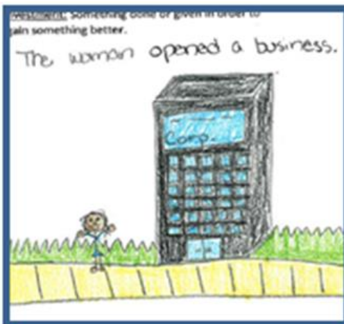
The Investment: The woman opened a business