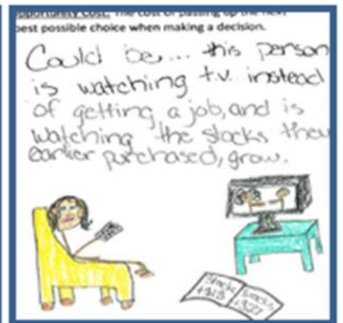
The Opportunity Cost: The person watching T.V. instead of getting a job.